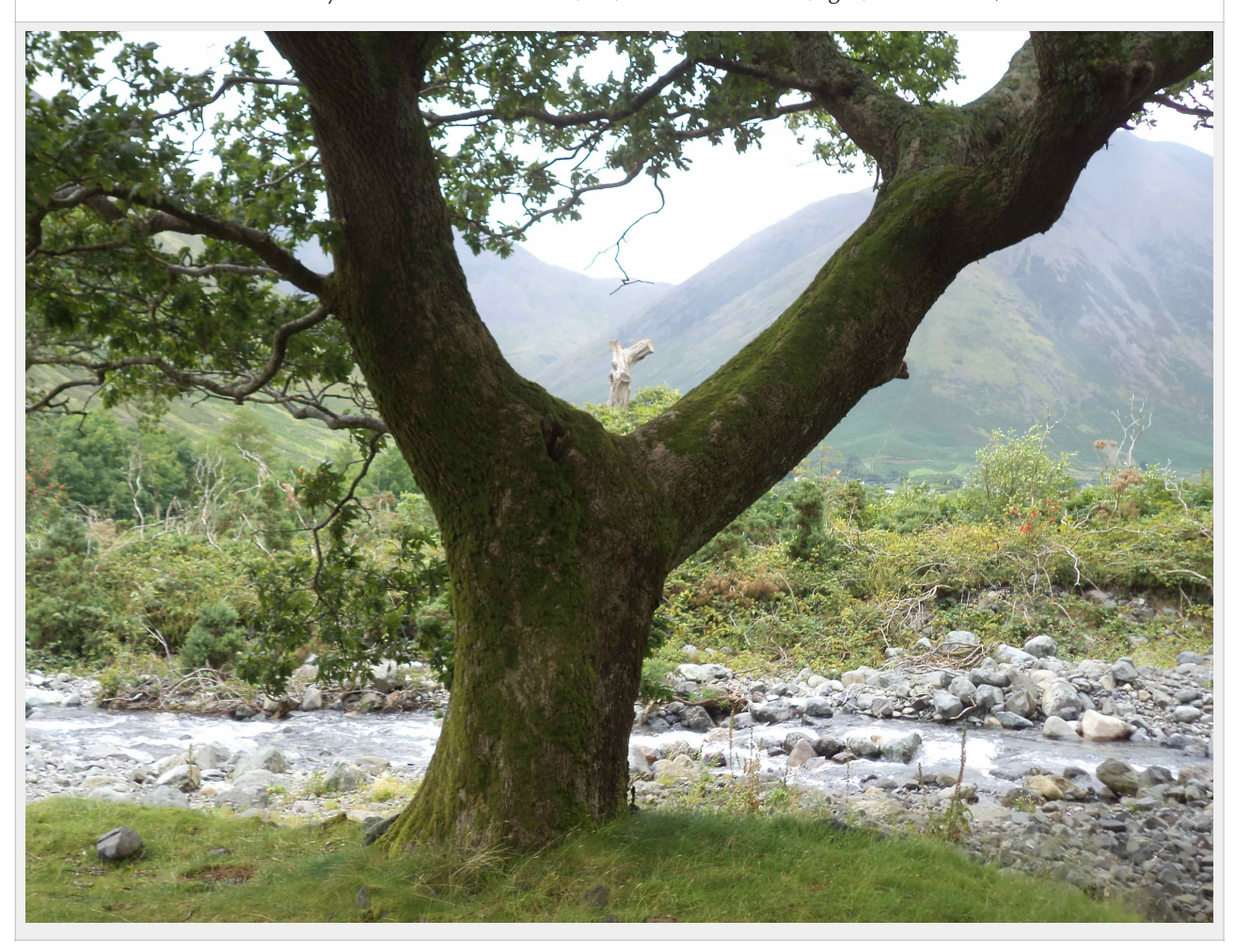
A view of the valley between Middle Fell (left) and Yewbarrow (right) in Wasdale, Cumbria.